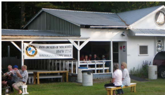
BMWONS Bavarian Welcome & Brass Band ☺

Also, we have been, for the fourth year, designated the Continental Rally for FIM North America. (FIM = Fédération Internationale de Motocyclisme www.fim-live.com )